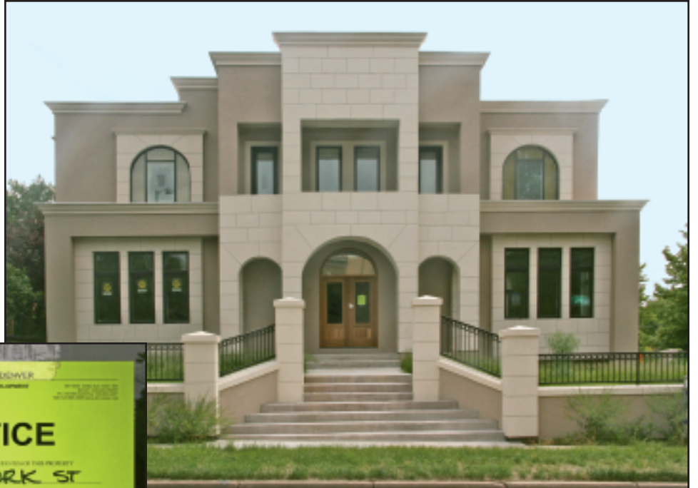
Above, Citations: This York Street grand "spec" home is on the market for $2.1 million but recently was given various municipal citations concerning the landscaping and while the façade is impressive the home is only 80 percent finished.

In 2005, Paul Kobey, Continued on page 14