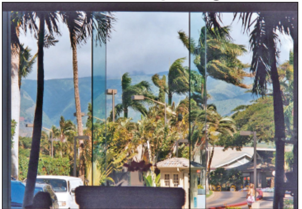
Winning Breeze: Drawing for the Grand Prize in Chronicle's Word Jumble Puzzle Contest will take place August 12 at huge beach block party on the SuperTarget lawn on Colorado Boulevard. Winner will beach at Maui's Kaanapali Shores Resort shown here.

be under a huge tent on the lawn at SuperTarget on Colorado Boulevard between Applebee's and Shotgun Willie's. Applebee's Neighborhood Bar & Grill will be grilling big wave gourmet burgers on the sunny beach; with Bull & Bush Pub & Brewery providing