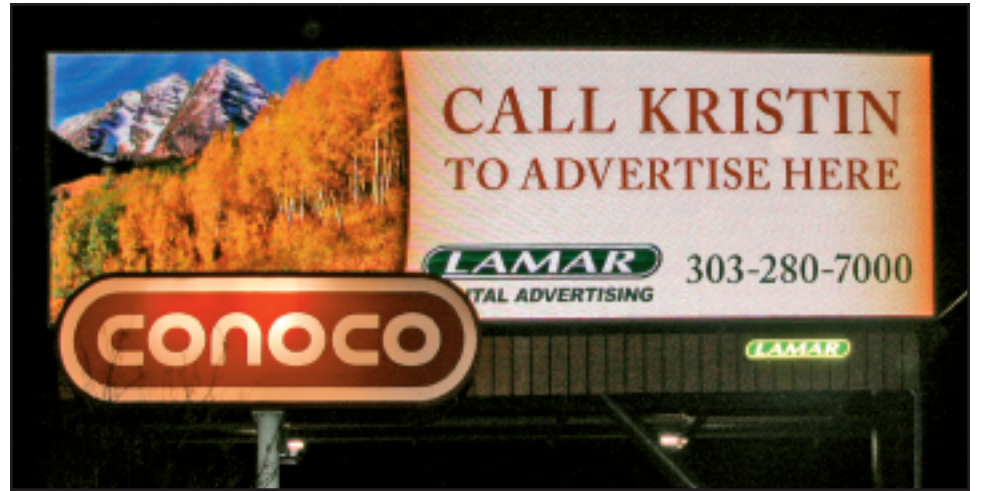
Bright Advertising: With LED signs appearing all over the Cherry Creek Valley and Colorado, it is no surprise that a large LED billboard now resides at the corner of Colorado Blvd. and East Mexico Avenue.

But on January 27, 2010, the City Council's Blueprint Denver committee approved a ban on LED signs which is subject to the full City Council taking up the issue.