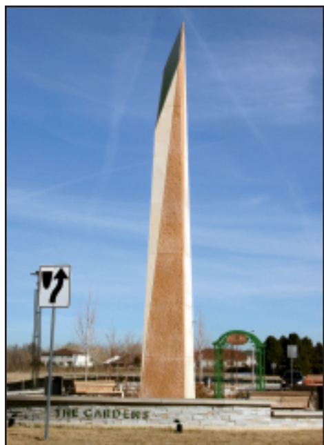
United Community: Situated on the boundary between Denver and Aurora, Havana Street is by nature decentralized. However, developments like the Gardens on Havana retail village offer residents a focal point around which the community can coalesce.